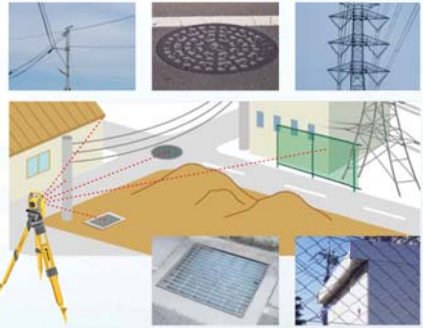
The ultra-narrow EDM beam can precisely measure walls, corners, manholes on the surface, even chain-link fences and tree branches.